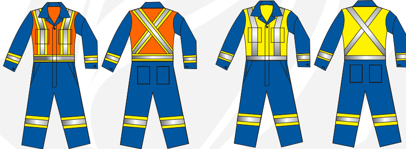
FR : Bright Orange w/ Fluorescent Striping

Speeds In Excess of 30 km/h (20 mph) CSA Z96 Class 3 Alternatives to WorkSafeBC Type 2 = Fluorescent Garment , or Fluorescent Side by Side Striping