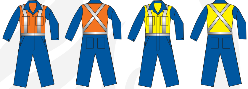
NON-FR: Fluorescent Yellow & Fluorescent Orange