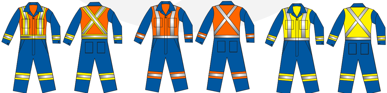
NON-FR: Fluorescent Yellow & Fluorescent Orange